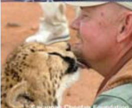
Savannah Cheetah Foundation