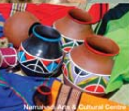
Numanak Cultural Centre