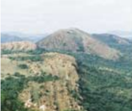
Vredefort Dome World Heritage Site