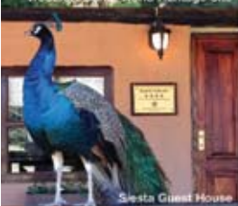
Siesta Guest House