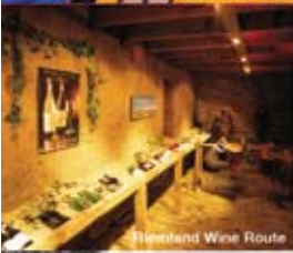
Riemland Wine Route