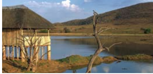
GAME VIEWING, PILANESBERG NATIONAL PARK